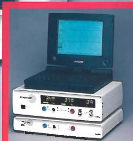
Combination with rheoscreen compact for venous occlusion plethysmography and rheographic pulse wave analysis